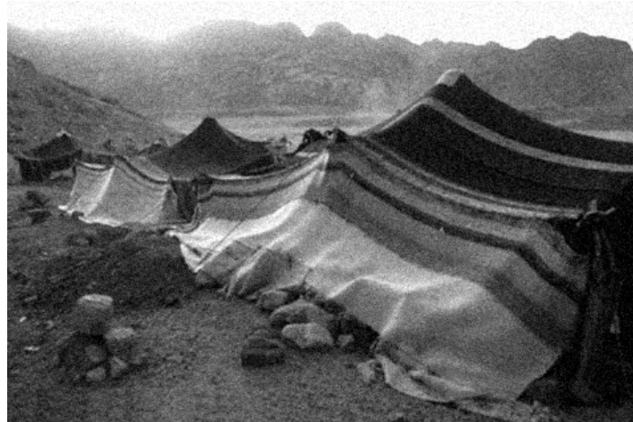
And my father dwelt in a tent. (1 Nephi 2:15)

Since we are meeting for sacrament meeting first we can continue being taught during the entire block after this sanctifying ordinance.