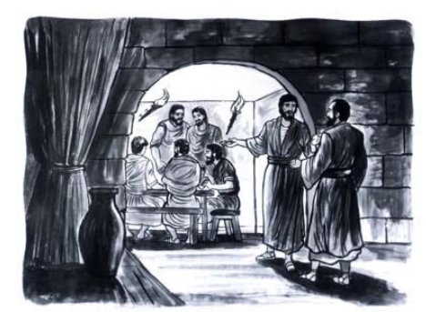
Paul brought before King Agrippa and the Roman governor Festus