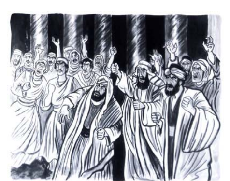
The riot at the Temple