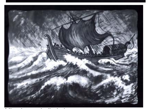
Miracles and tribulations at sea